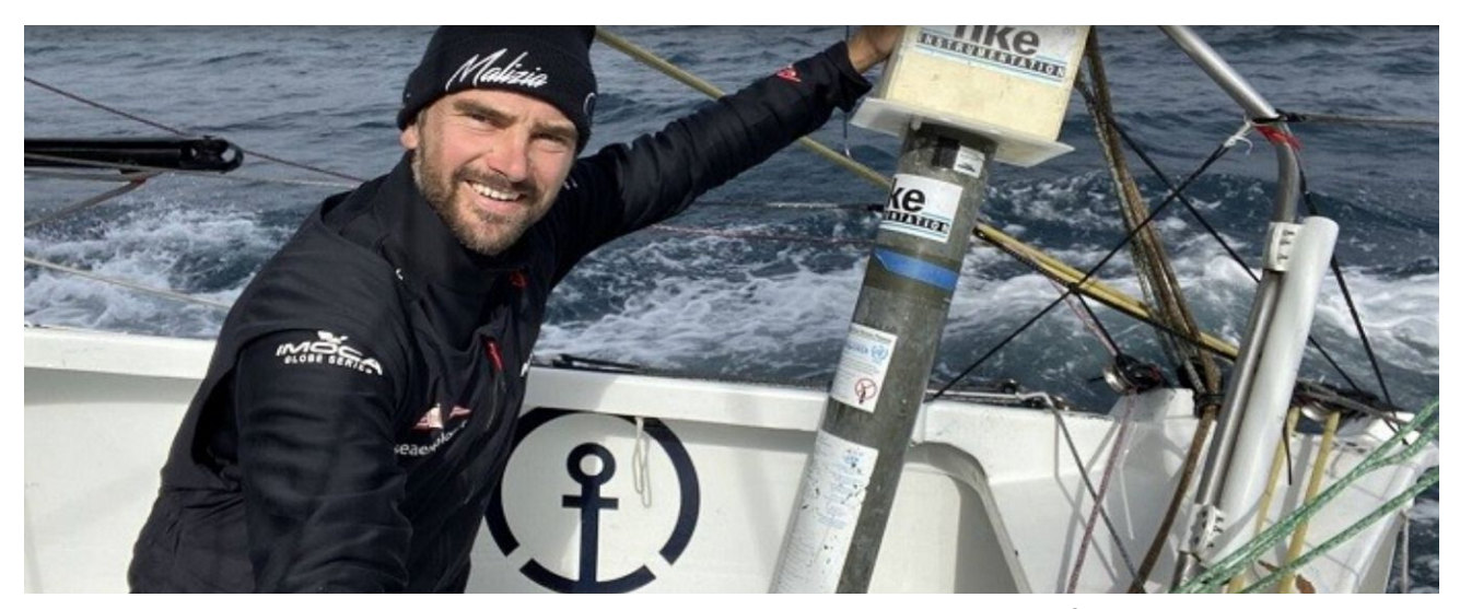
Boris Herrmann, skipper on Seaexplorer - Yacht Club de Monaco, released an Argo float during the Vendee Globe 2020

From the start of the Vendée Globe race, 10 skippers will carry scientific instruments onboard to support the Global Ocean Observing System (GOOS), within the framework of the United Nations Decade of Ocean Science for Sustainable Development (2021-2030). During the Vendée Globe, 7 meteorological buoys and 3 Argo profiling floats will be deployed by the IMOCA skippers, in under-sampled areas of the ocean. "Racing yachts allow us to reach remote and not yet well sampled areas of the ocean, filling critical observational gaps, especially during this challenging pandemic period" says Mathieu Belbéoch, OceanOPS Lead. The instruments deployed during the race will monitor the global ocean and measure physical and biogeochemical parameters, including pCO_2 , providing key data for applications such as climate studies, forecasts and early warnings, and marine ecosystems health monitoring.