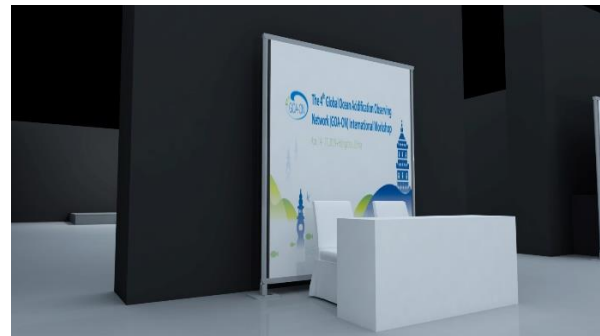
Figure 1 Illustration of a standard booth (2 m×2.2 m, a draped table and two chairs)